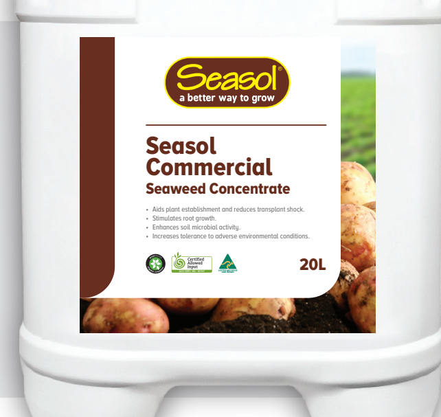
Soil and Fertiliser

Seaweed extracts are effective across a wide variety of plants and soils, and have many beneficial plant growth and plant health properties (Arioli et al, 2015; Shukla et al, 2019; Islam et al, 2020)