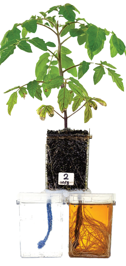
Water / Seasol